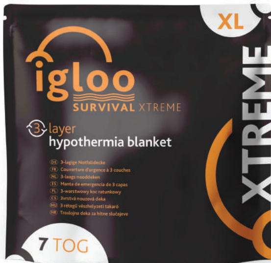
IG006 IGLOO XTREME 3-LAYER HYPOTHERMIA BLANKET + HEAT X LARGE | Emergency Orange 2.3m x 2m | 7 TOG

A 3-layer blanket with heat pads: Designed to maintain body heat in scenarios involving critical, life threatening, injuries and conditions.