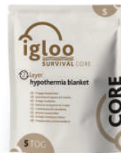
IG011 IGLOO CORE 2-LAYER HYPOTHERMIA BLANKET SMALL | Coyote Brown 1.1m x 1.5m | 5 TOG