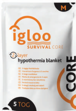
IG010 IGLOO CORE 2-LAYER HYPOTHERMIA BLANKET MEDIUM | Emergency Orange 2.3m x 1.5m | 5 TOG

A 2-layer blanket: Designed to maintain body heat.