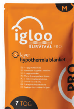
IG008 IGLOO PRO 3-LAYER HYPOTHERMIA BLANKET MEDIUM | Emergency Orange 2.3m x 1.5m | 7 TOG