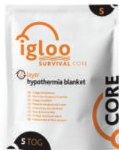
IG012 IGLOO PRO HYPOTHERMIA BLANKET SMALL | Emergency Orange 1.1m x 1.5m | 5 TOG