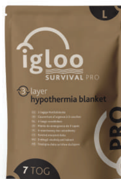
IG001 IGLOO PRO 3-LAYER HYPOTHERMIA BLANKET LARGE | Coyote Brown 2.3m x 1.8m | 7 TOG