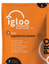
IG015 IGLOO PRO HYPOTHERMIA BLANKET BABY | Emergency Orange 1.1m x 1.5m | 7 TOG