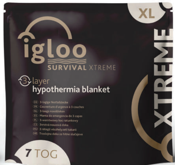
IG005 IGLOO XTREME 3-LAYER HYPOTHERMIA BLANKET + HEAT X LARGE | Coyote Brown 2.3m x 2m | 7 TOG