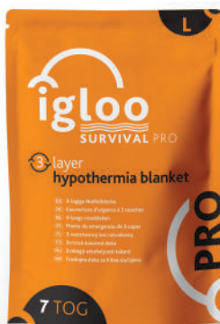
IG002 IGLOO PRO 3-LAYER HYPOTHERMIA BLANKET LARGE | Emergency Orange 2.3m x 1.8m | 7 TOG