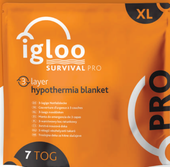
IG004 IGLOO PRO 3-LAYER HYPOTHERMIA BLANKET X LARGE | Emergency Orange 2.3m x 2m | 7 TOG

A 3-layer blanket: Designed to maintain body heat in scenarios involving critical, life-threatening, injuries and conditions.