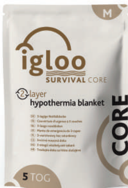
IG009 IGLOO CORE 2-LAYER HYPOTHERMIA BLANKET MEDIUM | Coyote Brown 2.3m x 1.5m | 5 TOG