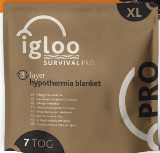
IG003 IGLOO PRO 3-LAYER HYPOTHERMIA BLANKET X LARGE | Coyote Brown 2.3m x 2m | 7 TOG