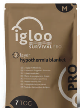
IG007 IGLOO PRO 3-LAYER HYPOTHERMIA BLANKET MEDIUM | Coyote Brown 2.3m x 1.5m | 7 TOG